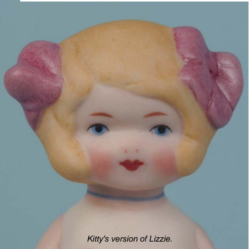
Kitty's version of Lizzie.