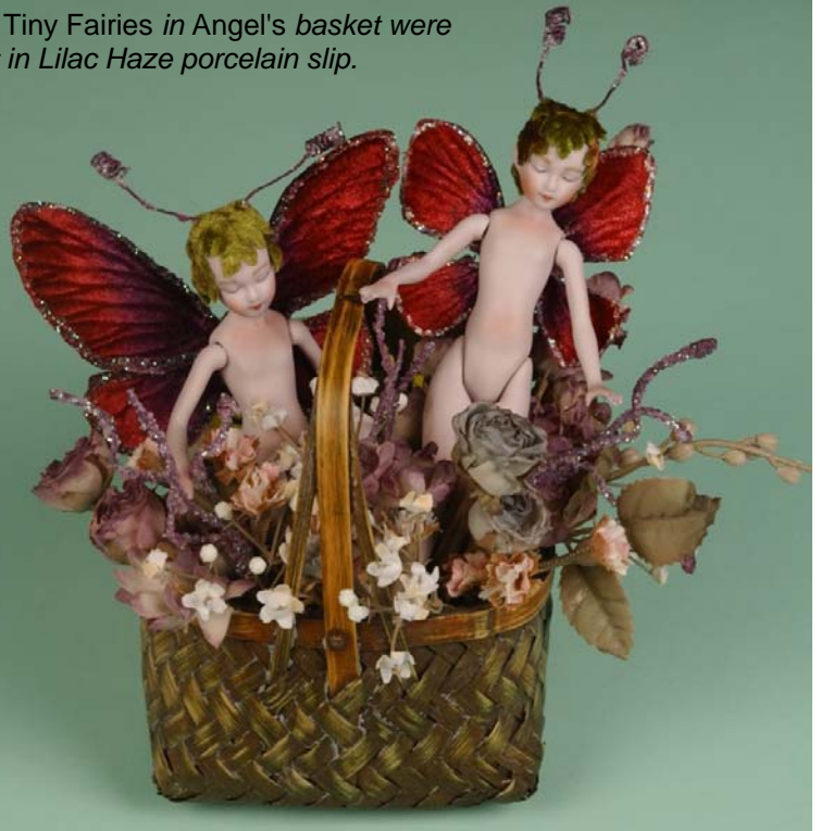
The Tiny Fairies in Angel's basket were cast in Lilac Haze porcelain slip.

P.O. Box 1113 Oneonta, NY 13820, USA Phone: (607) 432-4977, Fax: (607) 432-2042 Email info@dollartisanguild.org Website: www.dollartisanguild.org